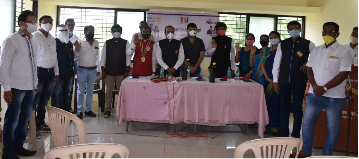
Board of Directors being Installed