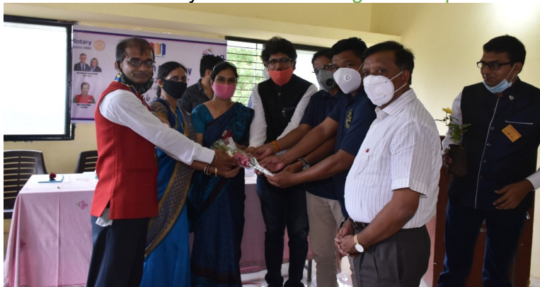
Cognizance of and by other Clubs