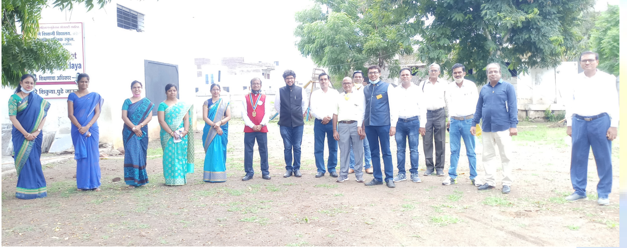
With newly inducted members